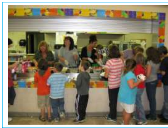
Above: Milford, MA Coordinators dollop fresh fruit toppings on students' yoghurt sundaes; June 2010

In 1995 school savings became "schoolsavings.com" by accepting its first deposits online. Today hundreds of thousands of students make deposits at school using "schoolsavings.com" technology. Millions of young Americans still benefit from the early savings lessons and banking habits they established as school savers.