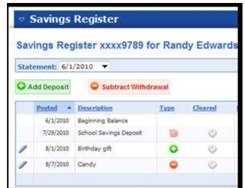
Figure 1: Screenshot of Websaver's Online Savings Register.

2010 Websaver® Training DEMO login: demovol@schoolsavings.com password: <Pls. call 888-787-7728>.